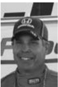
Super Touring Lite Cliff Ira Kansas City, Mo. Acura Integra GSR