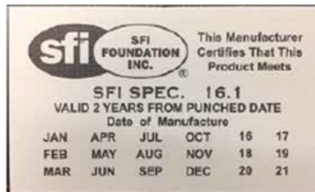
SFI Labels Prior to 2017