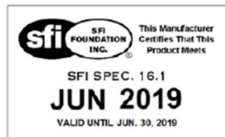
SFI Labels Available Jan. 1, 2017